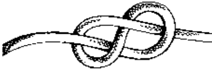
Figure 8 knot

All parachute systems equipped with an Argus AAD should have their disk checked and replaced after each repack. Aviacom highly recommends replacing all smiley washers with stronger steel washers using a figure 8 knot for the loop. Free steel washers will be supplied upon request to all Argus users with mentioning serial number and date of manufacture.